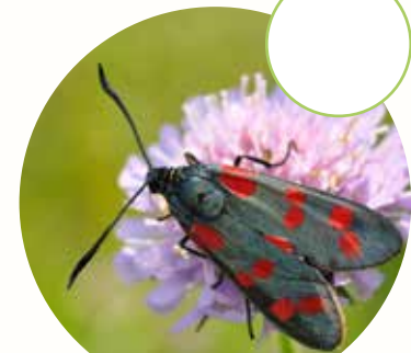
Six-spot burnet moth

Have you seen any other creatures? Draw what you have seen in the circles below.