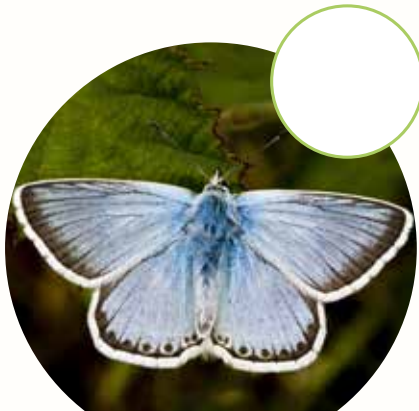
Chalkhill blue butterfly