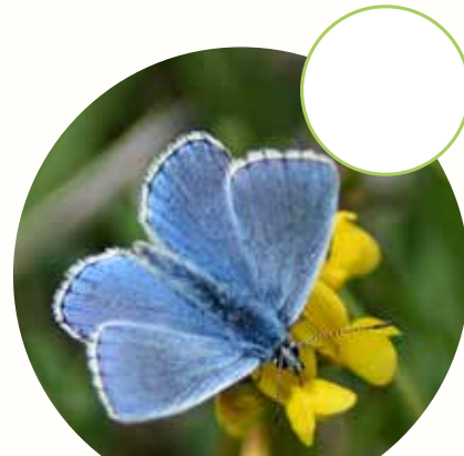
Adonis blue butterfly